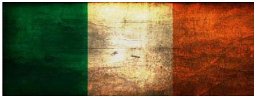
Irish Influence in the Adirondacks An exhibit by the Irish American Heritage Museum

One of the geographic areas in which thousands of Irish immigrants had a significant influence was indeed the Adirondack Mountains. The Irish and their descendants (Irish Americans) have a long history of helping to establish and develop the villages and towns and thus the culture and economy within the Adirondack Mountain Region.