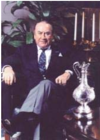
Governor Hugh L. Carey