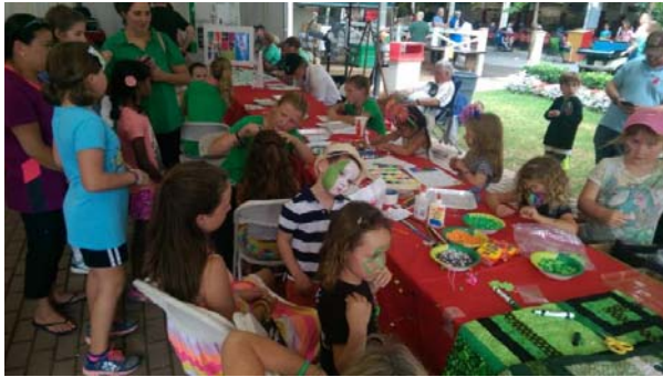
Arts and crafts table at 2016 Irish American Day at Saratoga Race Course.

mist in the morning. We hope to see everyone at Saratoga for the 2017 event.