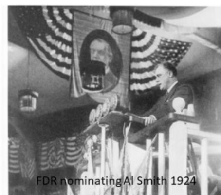
FDR nominating Al Smith 1924