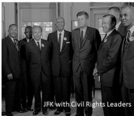
JFK with Civil Rights Leaders