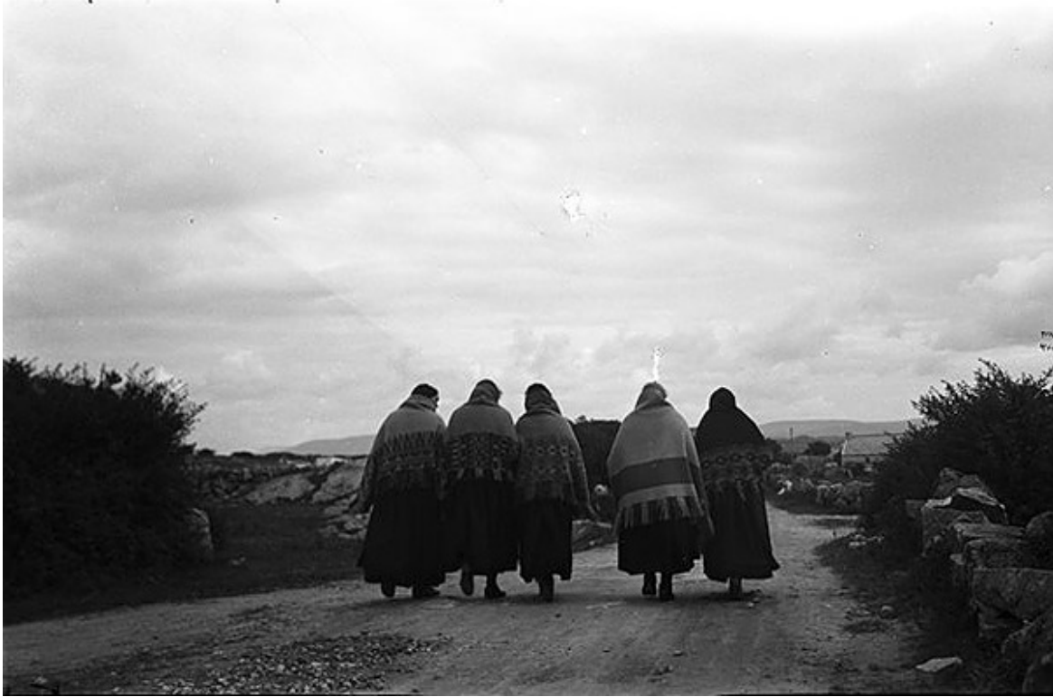
Women on the road, Carrowroe, County Galway

I've selected this as January's poem in honor of the Irish holiday of "Little Christmas," also known as Nollaig na mBan , or "Women's Christmas." Celebrated on January 6, also the Feast of the Epiphany, women would get the day off and men would do the housework and cooking. The holiday is no longer widely celebrated, but in some towns, particularly in Cork and Kerry, women will mark the day by going for a drink or meal with friends.