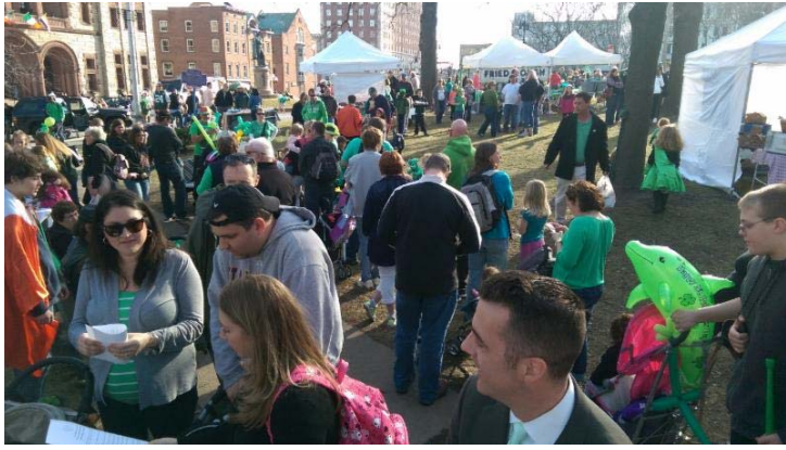
Fantastic crowd at the 2016 Family Fest