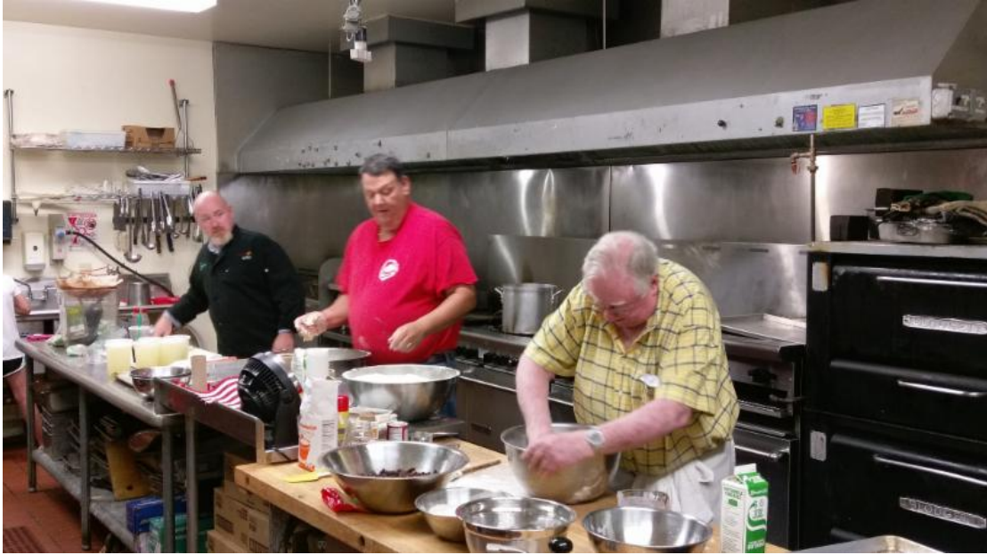
Our team of Irish American chefs prepping for Irish American Day at Saratoga Race Course