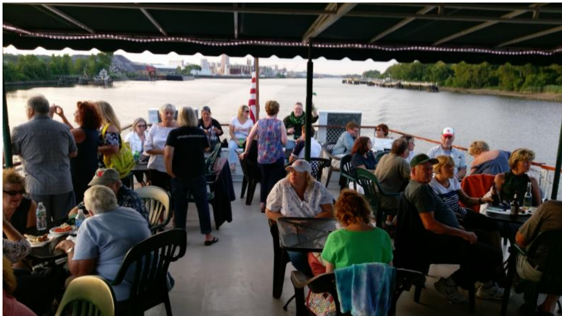
Passengers on the top deck of the Dutch Apple during the 2017 Capital District Celtic Cruise