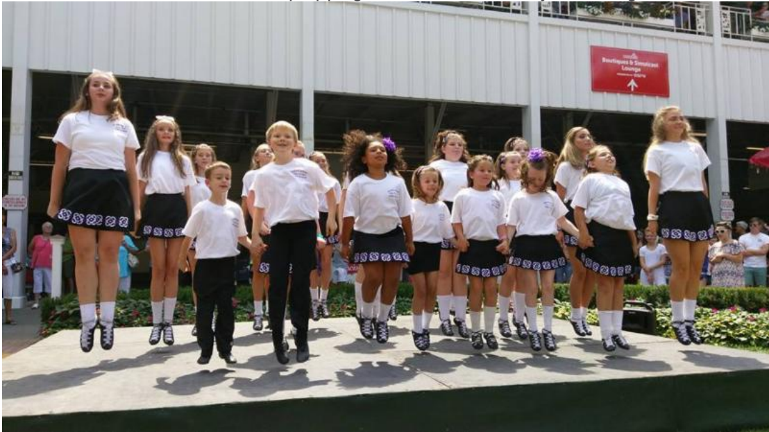
The Boland School of Irish Dance performing at Irish American Day at Saratoga Race Course