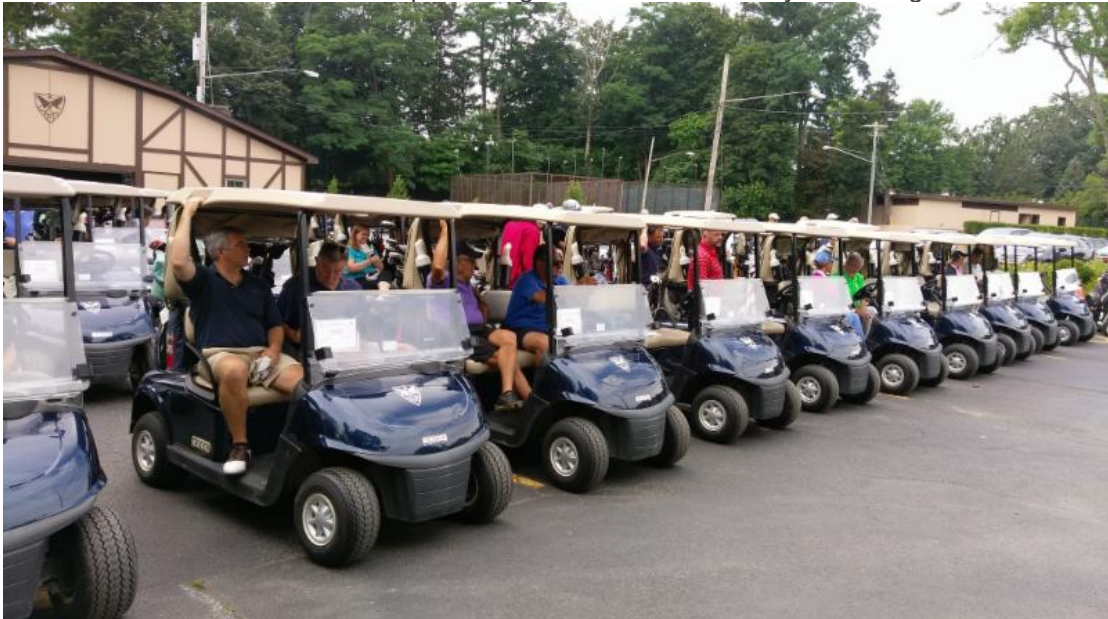
Golfers getting ready to participate in the 2017 Mostly Irish Classic