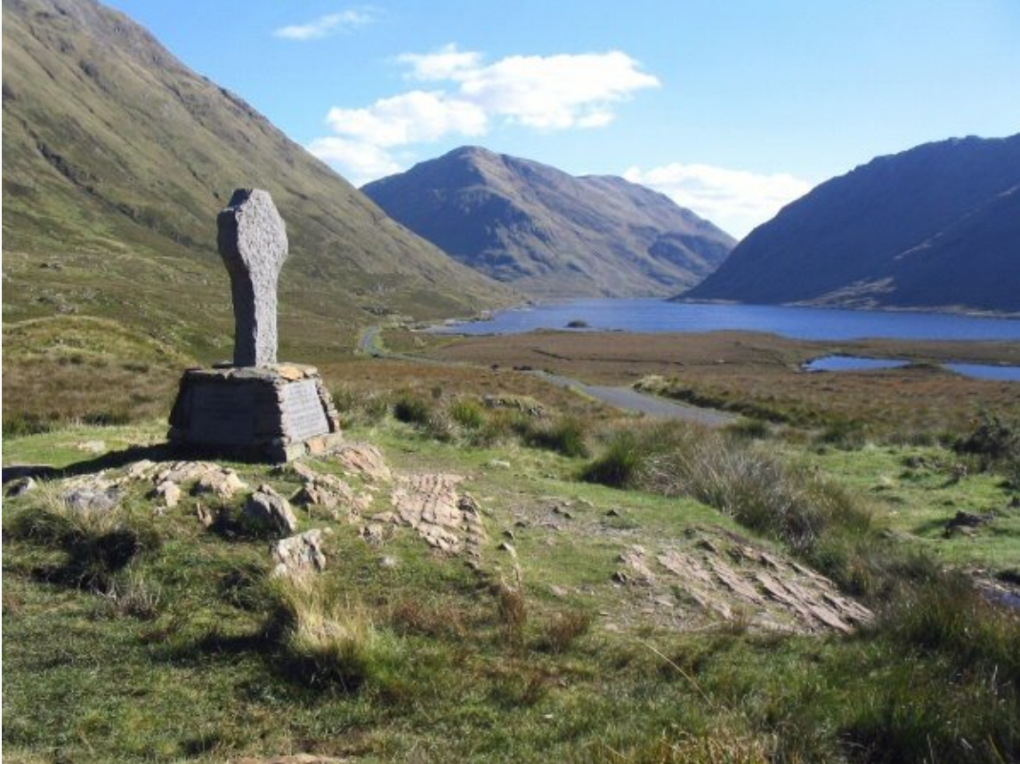
Doolough, Great Hunger Memorial, Trail of Tears.